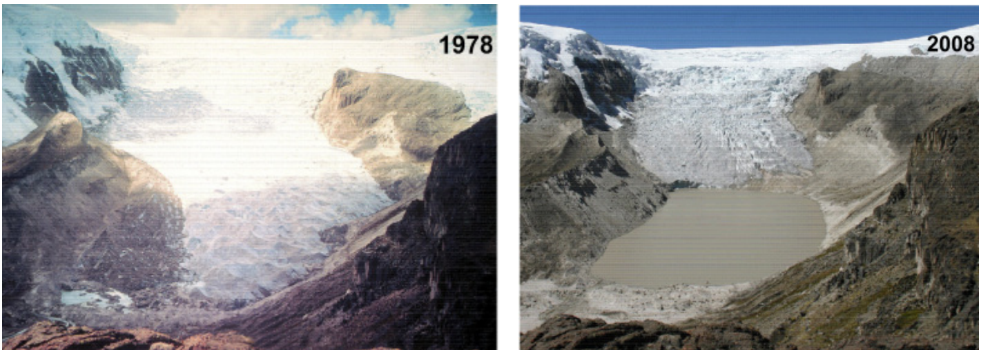
Qori Kalis outlet glacier (the largest outlet glacier from the Quelccaya Ice Cap in the southern Andes of Peru).

Mountain glaciers are lethally vulnerable to ongoing climate change